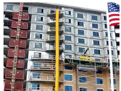
Piggybacked Frames One frame every few floors Click on the picture to see the full building