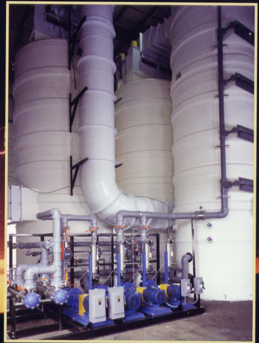
28,000 CFM CCS unit

"Best Available Technology" for Control of Submicron Particulate