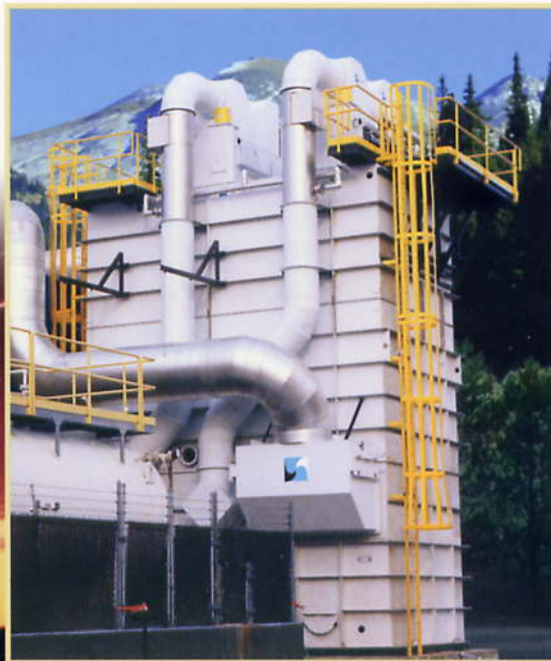
22,000 CFM CCS unit