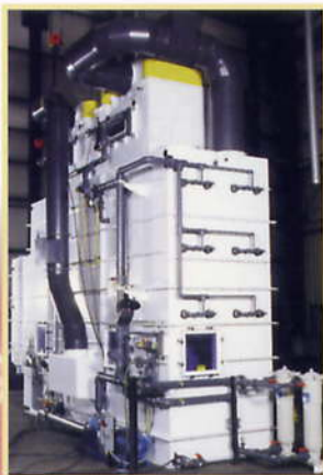
6,000 CFM CCS unit