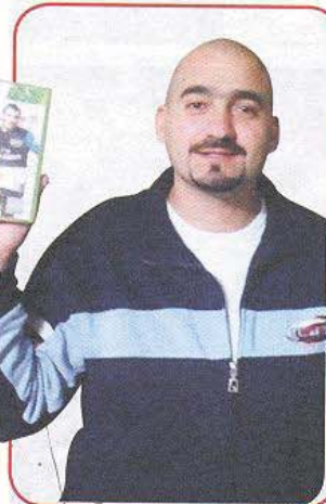
FIFA 12 FOR XBOX 360 Jorj Bader